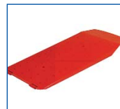
Drive Through Kit