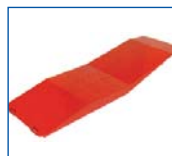
2 stage access ramps