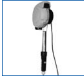
Inspection Lamp & Reel