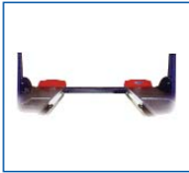
4 tube lighting kit