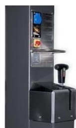
Control Box Progressive lowering and lifting speed